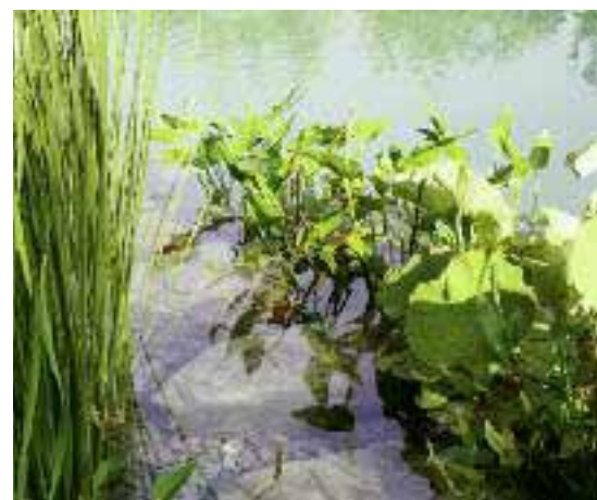
The clients led us to develop a number of playful details in the design with their ardent desire to capture the Disney spirit in their backyard. These included (among others) a thermal ledge lagoon, a spa-side campfire, submerged stepping stones through the planted area and a large wooden dock with ladder.