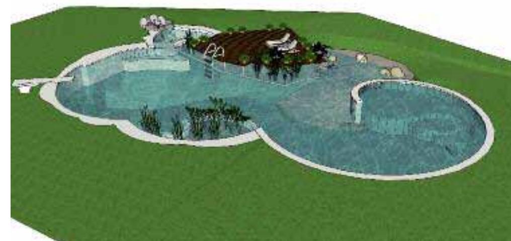
As the project took shape, our design conversations with the clients went back and forth mostly over the Internet, with discussions guided by AutoCAD drawings and SketchUp renderings (including the near-final one seen here) we sent to them.

We decided early on that the pool's interior finish would be PebbleTec (Pebble Technology, Scottsdale, Ariz.), but we wanted a deeper green than was available in the company's standard colors. Northeast representative Cliff Scheiber stepped up and had the staff in Arizona develop a custom color to provide the deeper shade.