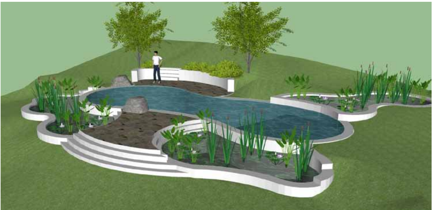
Rendering of a multi-chamber NSP to be constructed in Alexandria, VA by BioNova Dealer Partner Rin Robyn Pools.